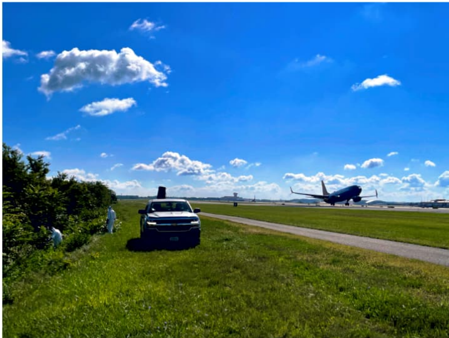
A USDA team does a spotted lanternfly treatment at the Pittsburgh International Airport.

Insecticide treatments have taken place in all 45 counties currently under the spotted lanternfly quarantine. These treatments are directed to sites where there is great risk of insect movement but low risk of environment harm, such as highly disturbed areas near truck distribution centers, rail yards, airports, or maritime ports. In 2022, 25,000 acres were treated.